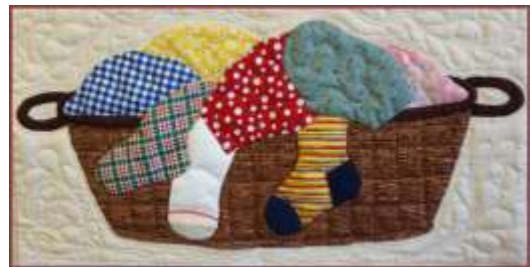
Detail of "A Woman's Work is Never Done"