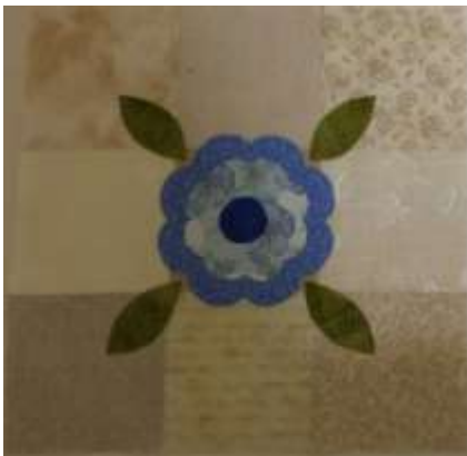
9 Patch with Raw Edge Appliqué

Block for April: The block is 12-1/2" x 12-1/2". Various light to medium green; spring colors such as pink, purple or yellow. These will also be light to medium. The size is 2" x 6-1/2" for each piece. (See March newsletter)