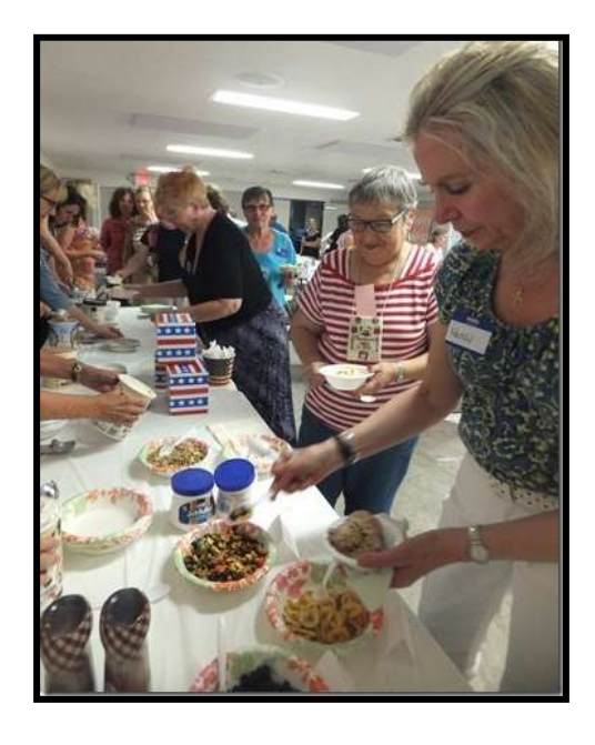
Yum! Great Toppings at our July Ice Cream Social

August 4th to register and pay, or call her at 559-536-6532 if you have any questions.