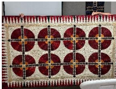
Workshop participants made beautiful samples "Starting With Silk."