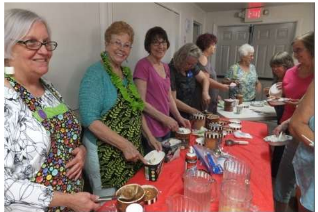
Serving ice cream at July meeting