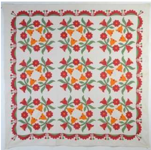
Floral Wreath Quilt, dated 1862 from Ohio

Lecture and Trunk Show: Quilt making – A Tour through Time – 1830 to 1930. A trunk show of antique quilt collection illustrating changes in quilt styles and fabric production during this 100 year period.