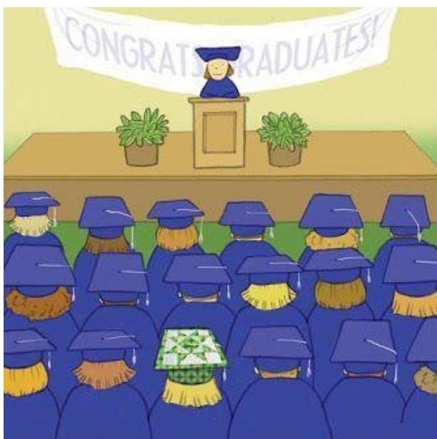
It is easy to spot a quilter in a crowd.